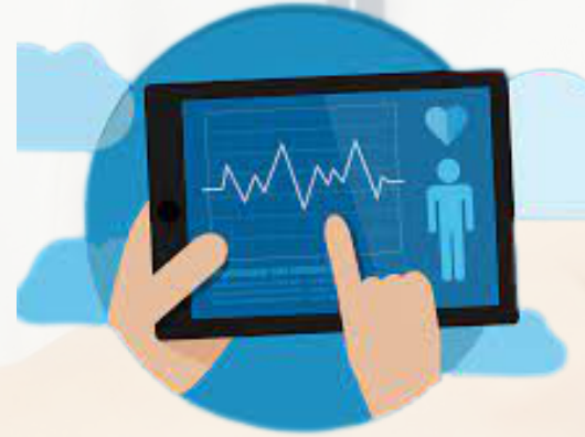
Digital Medical Records