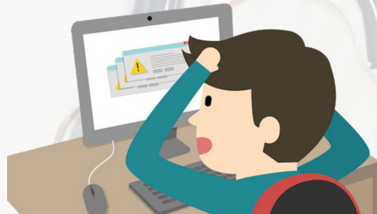
Avoid Mistakes & track each detail