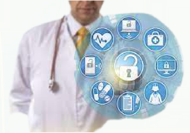
Better Data Security