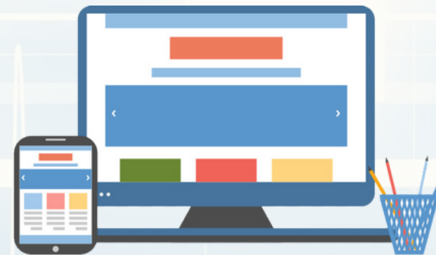
Financial & Insurance Manage